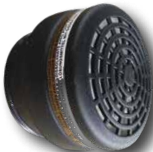
MODEL : 755ABEK1P3