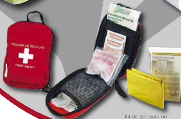
Kit de Secourisme