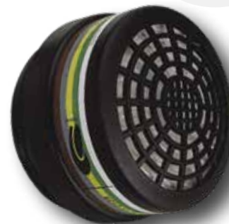
MODEL : 755A2P3