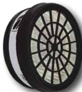
MODEL : 755P3