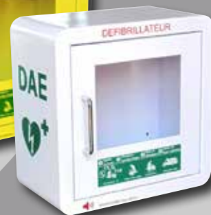
Boîtier Mural Défibrillateur Wap 812